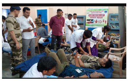
Blood Donor Day 14th June 2025 Blood Donation camp organized at Nuclear Fuel Complex (NFC). Thanks to team NFC!