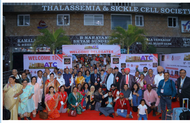
Asian Thalassaemia Conclave 2026—A great Success