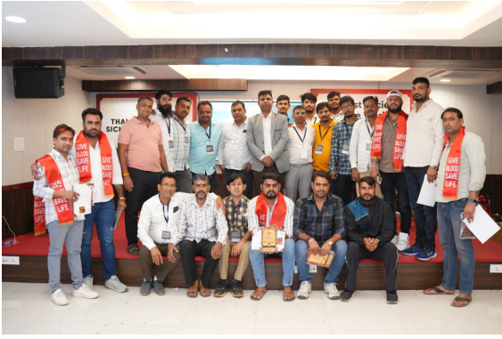
Thanks for organizing In-house blood donation camp