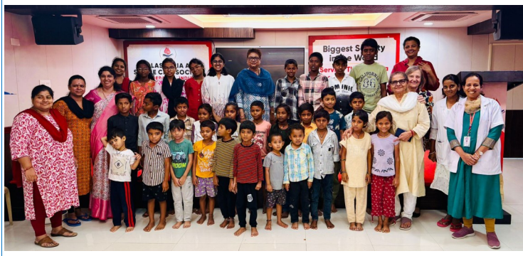
Team from UK visited TSCS for Transcranial doppler to access the risk of stroke in Sickle Cell Anemia patients